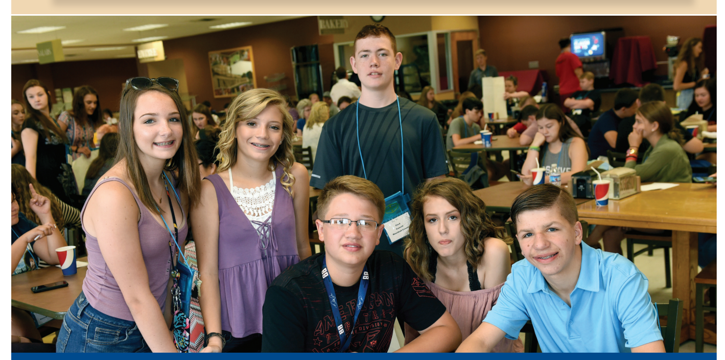
See more camp photos at http://wvculture.zenfolio.com