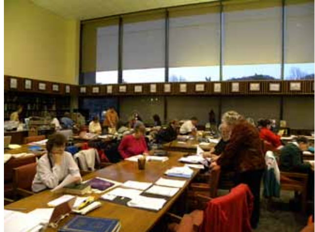
Hoot Owl in the Archives and History Library, March 26-27, 2010

The eleventh annual Hoot Owl was held in the Archives and History Library on March 26–27. Fifty-four people from as far away as Michigan and Florida attended the all-night event, co-sponsored by Archives and History and the Mining Your History Foundation. Staff and MYHF volunteers assisted researchers in locating materials. Proceeds from the annual event are dedicated to purchase and support the collections of the Archives library.