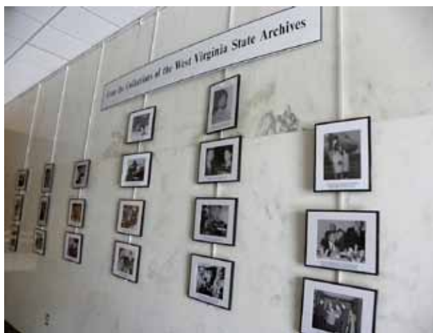
Exhibit of photographs on the 1960 presidential election campaign in West Virginia.

Archives and History continued to provide support to other sections within the Division of Culture and History. Although opening of the museum at the end of fiscal 2008-2009 virtually